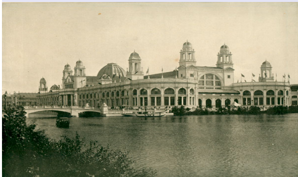
Electric Building, 1893 World's Fair

The expert professionals at TMK and Associates are now dedicated to bringing electrical safety services to employers and their employees world-wide in an effort to provide the safest workplace possible.